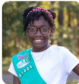
Juniors | 4-5 1,373