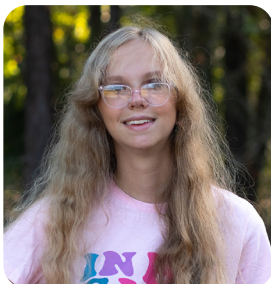
Seniors | 9-10 364