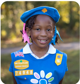
Daisies | K-1 1,473