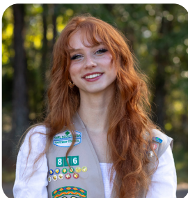
Ambassadors | 11-12 215