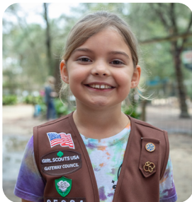
Brownies | 2-3 1,825