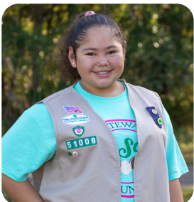
Cadettes | 6-8 1,074