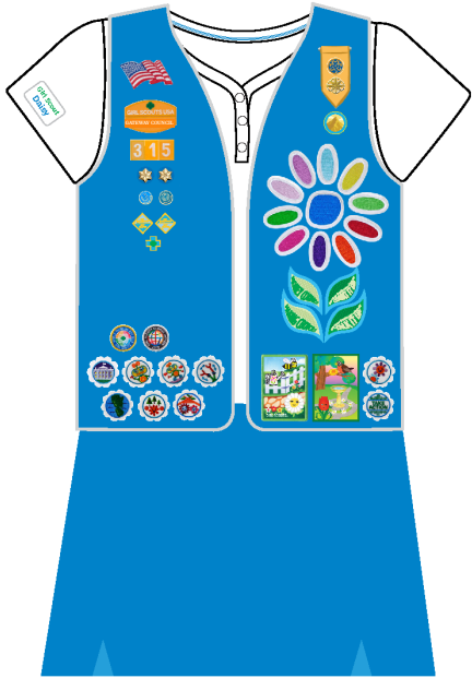
Girl Scout Daisy Vest