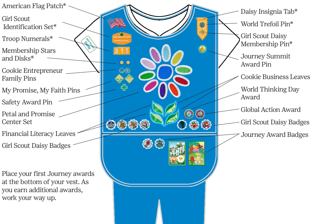
Girl Scout Daisy Tunic

Items with an asterisk indicate the basic starter patches and pins.